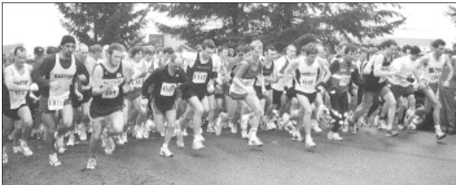
And they're off! Start line at the Cedar 12K